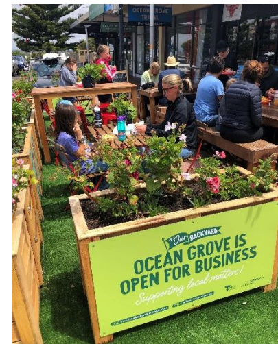
City of Greater Geelong (Ocean Grove)