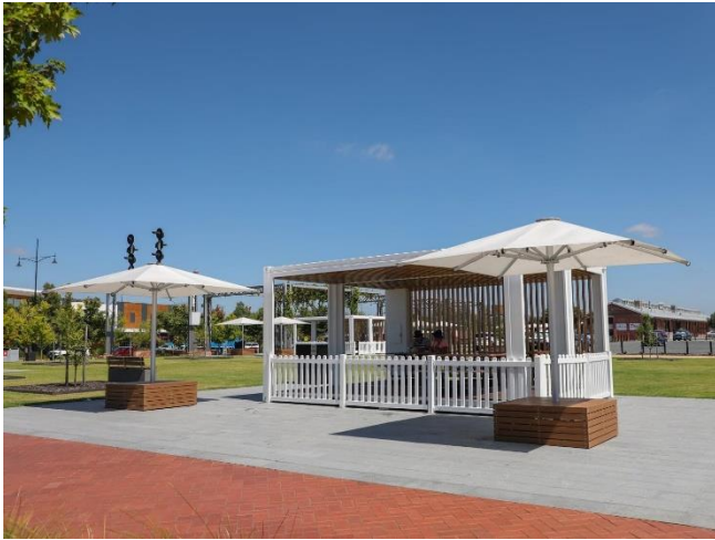
Junction Place Wodonga (VIC)